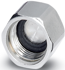
M12 metal sealing cap for unoccupied M12 plugs of the sensor/actuator cable, flush-type plugs and I/O devices in the field

Please be informed that the data shown in this PDF Document is generated from our Online Catalog. Please find the complete data in the user's documentation. Our General Terms of Use for Downloads are valid ( http://phoenixcontact.com/download )